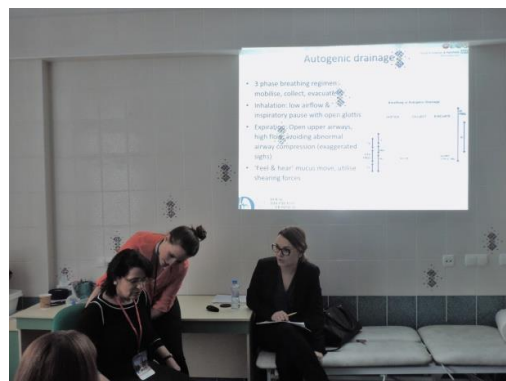
Demonstrating Autogenic Drainage