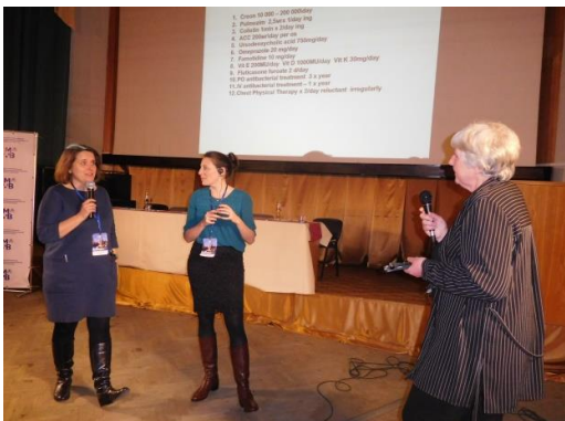
Discussing a local case

And there was time for a little sightseeing afterwards!